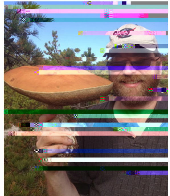
Professor of Mathematics, MIT Chief Research Adviser of MIT-PRIMES